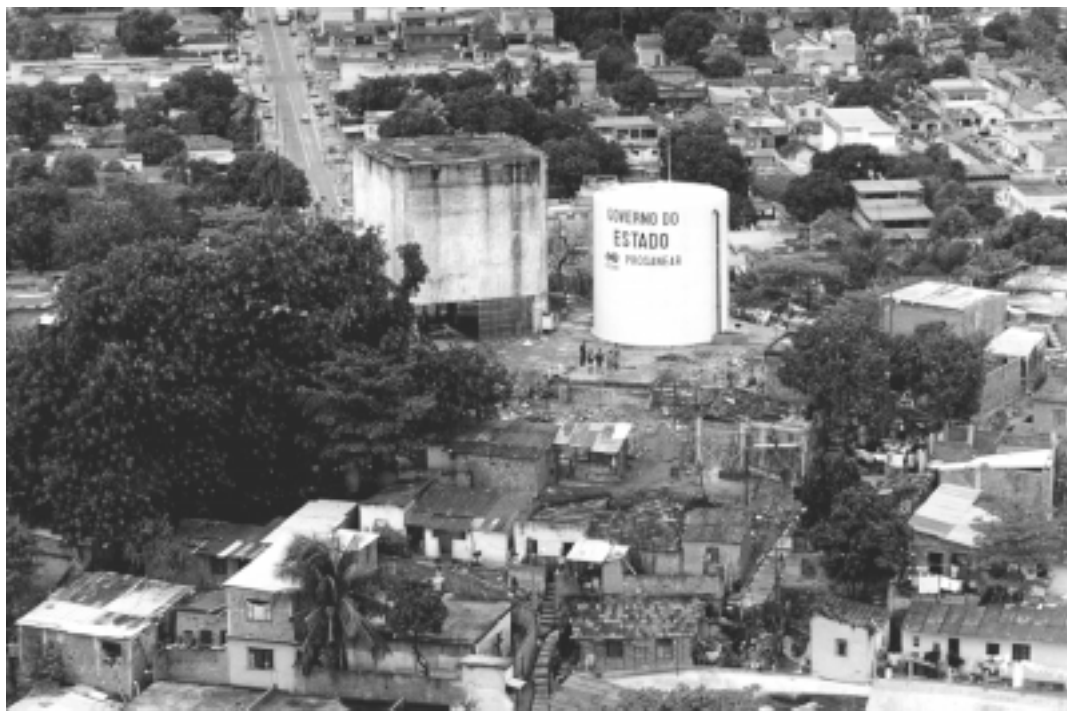
Morro União: 500 thousand liter metal reservoir

PROSANEAR began slowly and improved with experience. This experimental phase clearly demonstrated the power of combining community participation and low-cost technology. Residents learned they could work to improve their own communities, water companies learned that favelas make good customers, and governments learned that innovative solutions can work. The next round of projects will be even stronger thanks to the knowledge gained in the first round. There is every reason to hope that PROSANEAR's pragmatic combination of low-cost technology and community participation will enable water agencies to serve millions more of the urban poor, in Brazil and around the world.